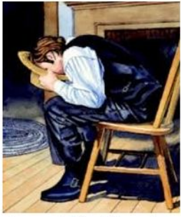
Joseph Smith using his special stones to translate the Book of Mormon

death on a cross, the Mormon Jesus was resurrected, at which time he traveled to North, Central and South America to preach to the native Indians there because they were, according to the Mormon church, descended from the Israelites.